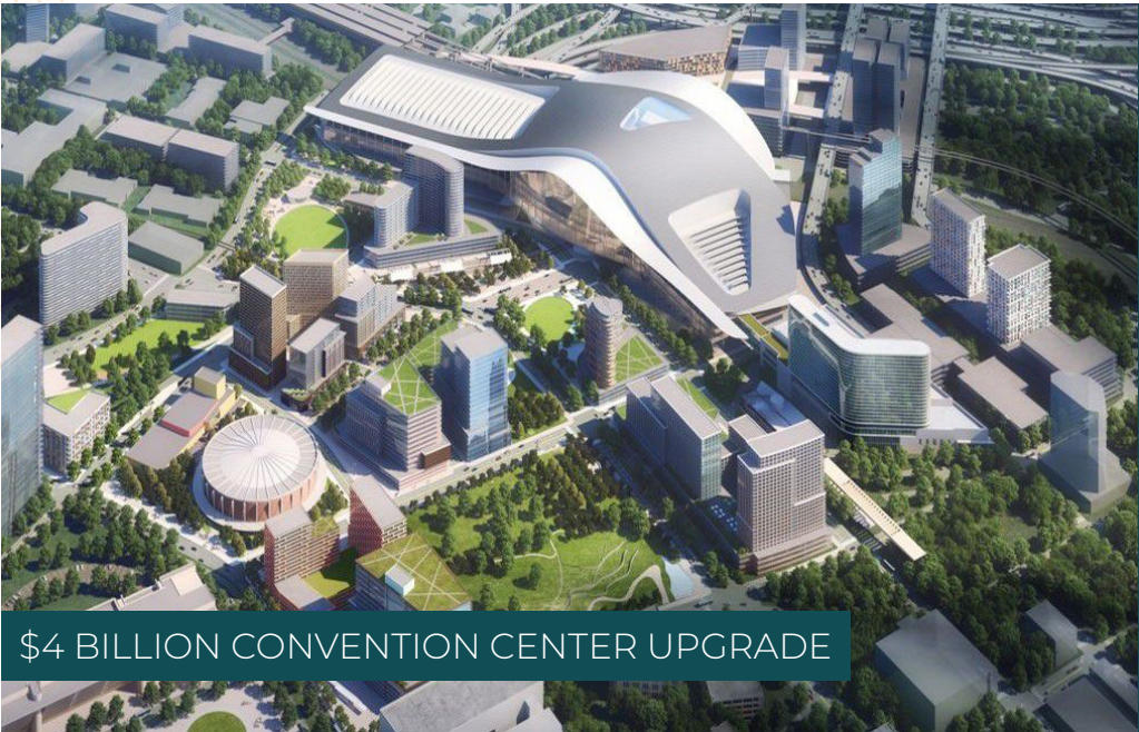
$4 BILLION CONVENTION CENTER UPGRADE