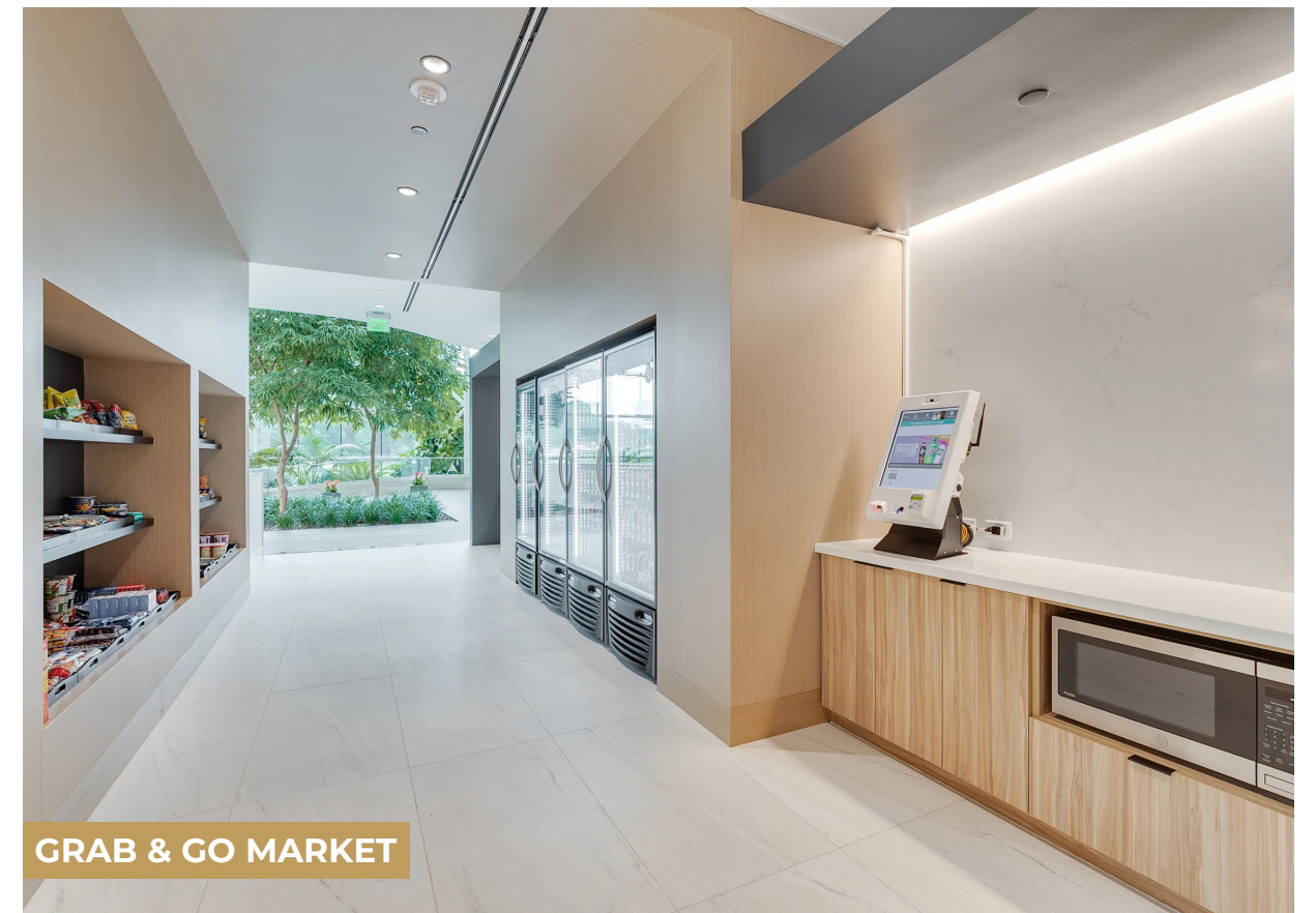
GRAB & GO MARKET